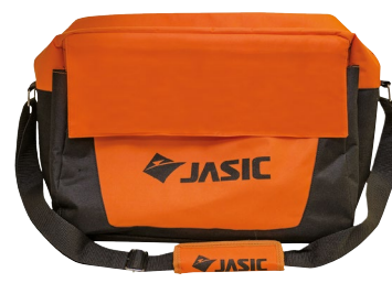
JSB-01 Site Bag