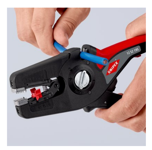
With cable cutter on the top side for up to 16 mm²